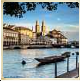
Banks of the Limmat River, Zurich