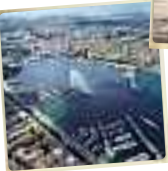
Lake basin, Geneva