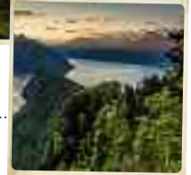
Ennetbürgen, Bürgenstock panorama, Lucerne-Lake Lucerne Region