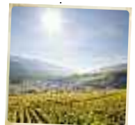
Wine area Salgesch, Valais