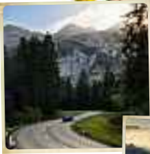
Schwägalp, Eastern Switzerland / Liechtenstein