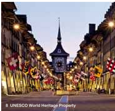
8 UNESCO World Heritage Property