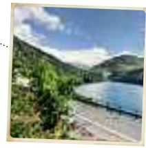
Marmorera reservoir, Graubünden

i The Grand Tour of Switzerland is a suggested route that makes use of the existing Swiss road network. Visitors follow the route at their own risk. Switzerland Tourism and the Grand Tour of Switzerland association accept no liability for construction works, diversions, signage relating to special events or safety provisions along the route.