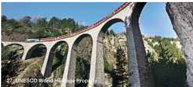
27 UNESCO World Heritage Property