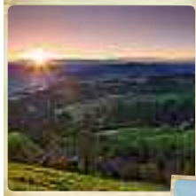
Affoltern in Emmental, Bern-Bernese Oberland